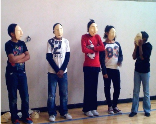
Children at the Battersea Park School/ Bigfoot Performing Arts Summer School discussing the future of Battersea!!